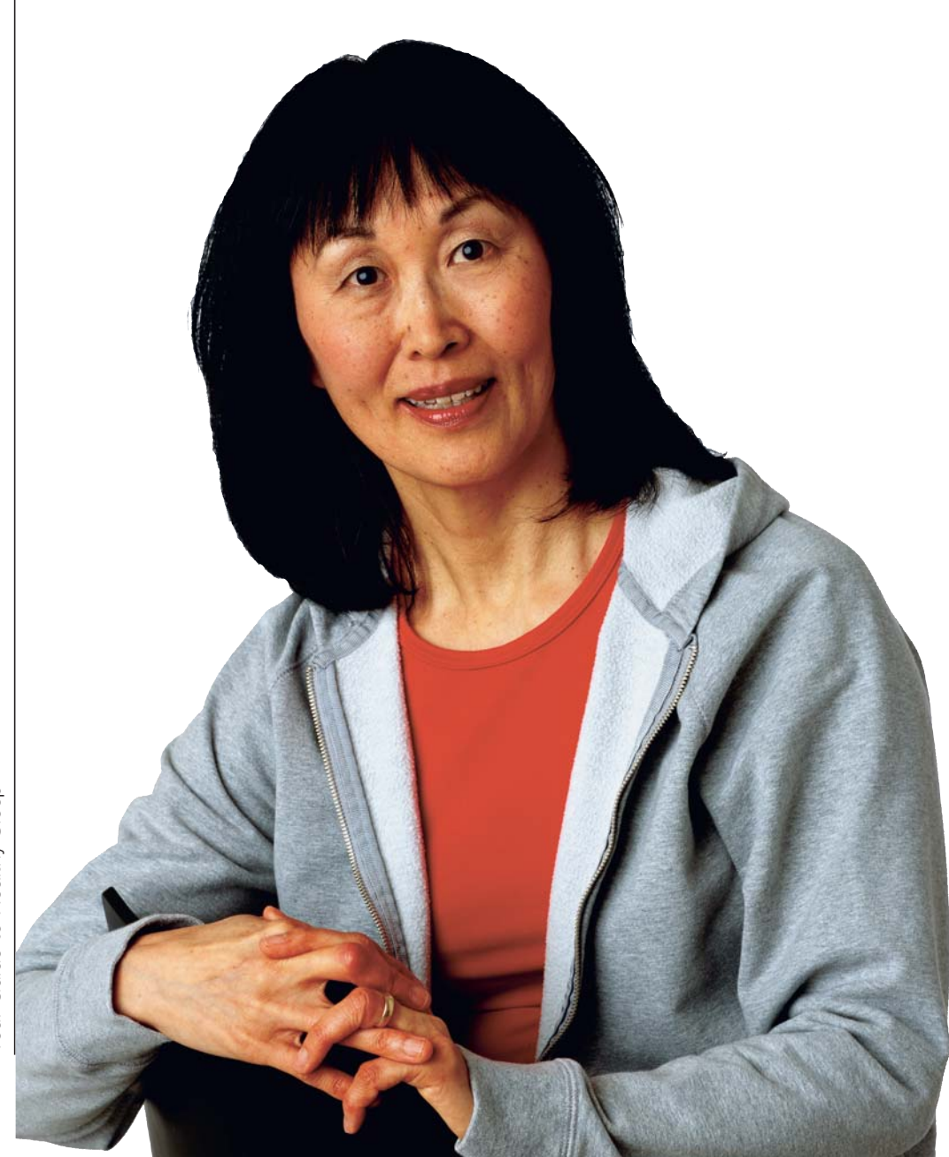
Your Guide to Healthy Sleep

once they become adults. People who are sleep-deprived also may experience some of these disorders, including sleep walking and sleep paralysis. Sleep paralysis also commonly occurs in people who have narcolepsy. Certain medications or neurological disorders appear to lead to other parasomnias, such as REM sleep behavior disorder, and these parasomnias tend to occur more in elderly people. If you or a family member has persistent episodes of sleep paralysis, sleep walking, or acting out of dreams, talk with your doctor.